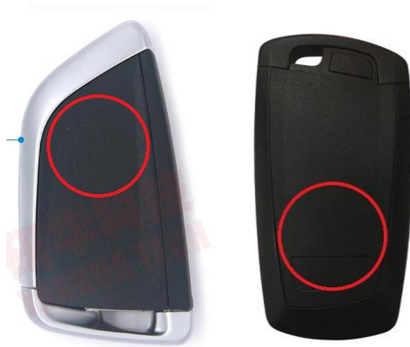
Pic. 2 Emergency-Start coil position

Put the key marked with red (see above pic.2) on the coil.