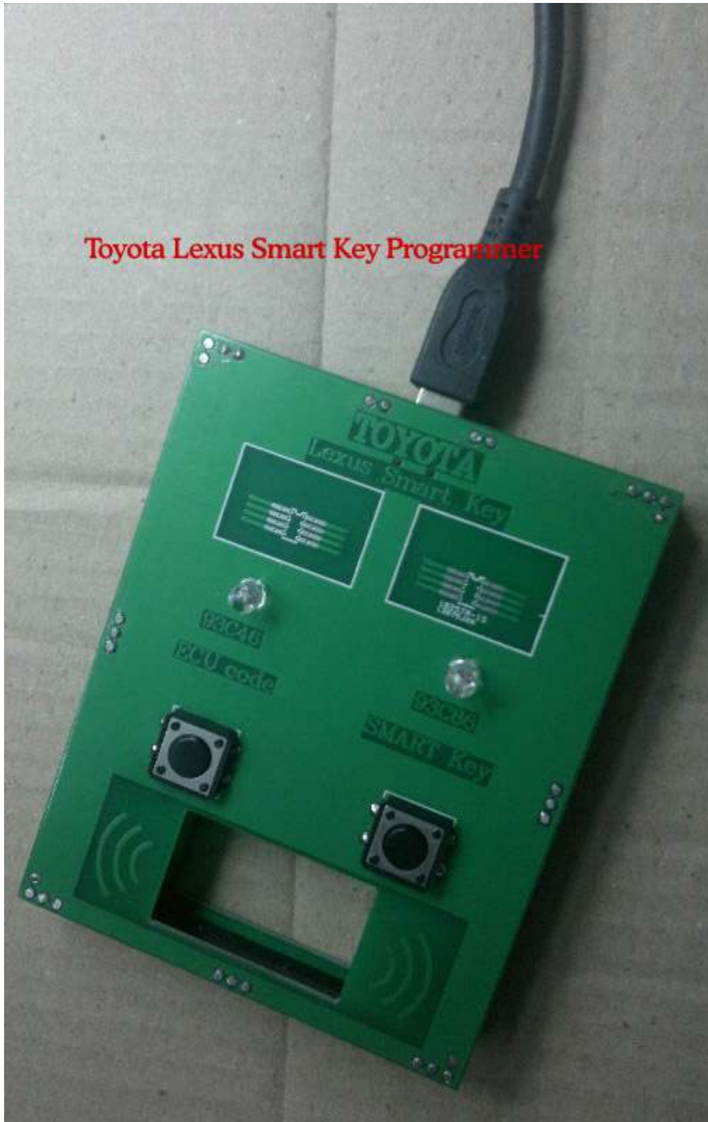
Toyota Lexus Smart Key Programmer