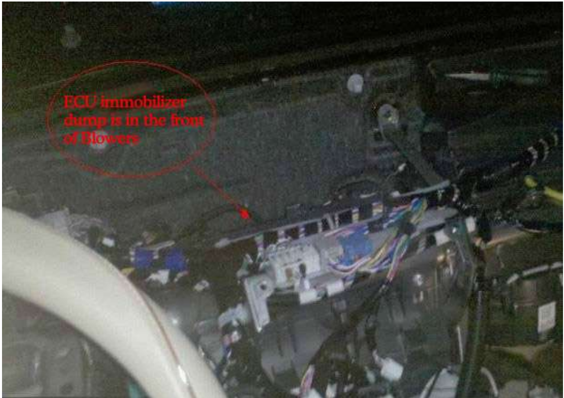
Camry ECU immobilizer dump NO 89784-06020, Reiz ECU immobilizer dump NO 89784-0N010