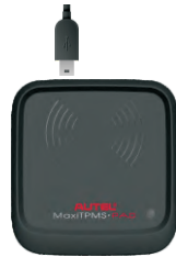
Connect Type B plug to the PAD.