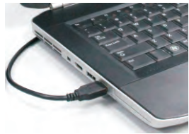
Connect Type A plug to the PC.

Connect the PAD to the PC using the supplied USB cable. The MaxiTPMS PAD program will always prompt you to connect the PAD before letting you start the process.