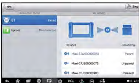
BLUETOOTH VCI CONNECTION

REGISTER AND UPDATE TOOLS UPON PURCHASE TO GUARANTEE LATEST VEHICLE COVERAGE