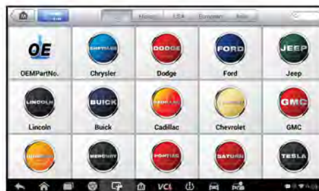
EXTENSIVE VEHICLE COVERAGE