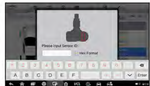
SENSOR ID PROGRAMMING