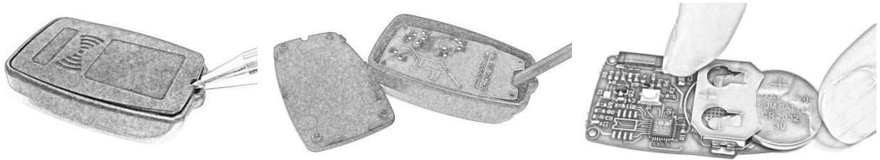
1. Open back cover